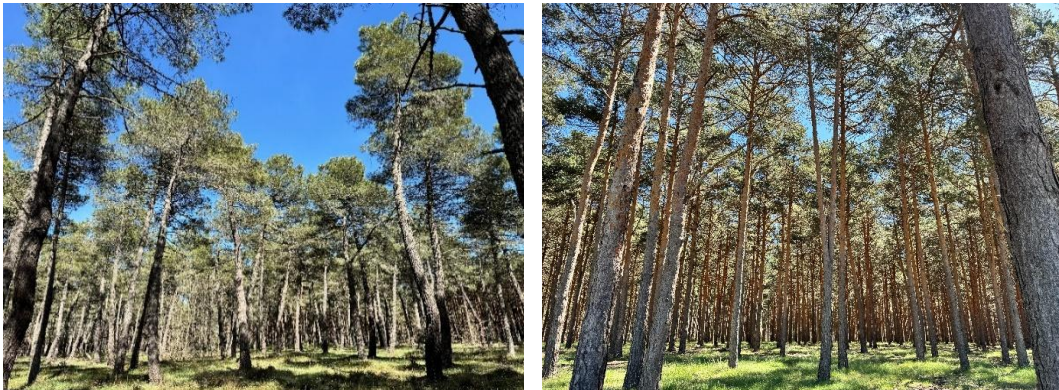
Figure 3: Pinus pinaster and Pinus sylvestris stands, respectively, in the LLVC south.

This methodology resonates with the concept of precision forestry, representing a technological extension of adaptive management principles applied at fine spatial scales. Precision forestry employs advanced tools – including terrestrial laser scanning (TLS), mobile laser scanning (MLS), UAV and aircraft-based sensors and satellite and aerial imagery – to achieve detailed, spatially explicit monitoring of forest conditions to optimize forest operations by improving efficiency, enhancing environmental protection and reducing waste. This approach rounds the circular economy from planting and monitoring to harvesting. These technologies improve forest inventories' spatial accuracy and support evidence-based decisions. Within the SingleTree project, precision forestry enables the design of targeted interventions, optimizing immediate forest conditions and long-term ecosystem resilience.