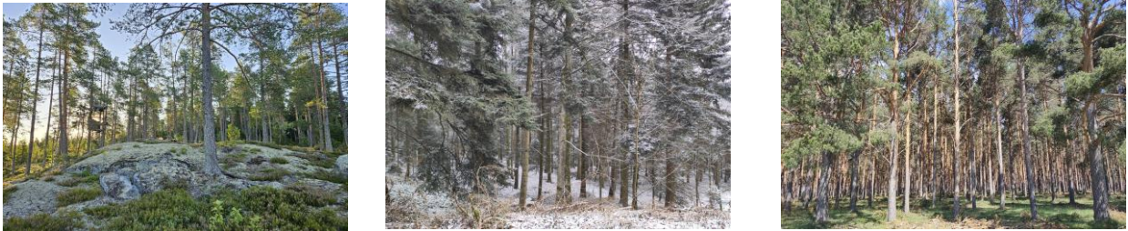
Figure 2: Captures of LLVC North, LLVC Central and LLVC South, respectively.

Based on these general criteria, adapted to region-specific frameworks, each LLVC can implement adaptive forest management strategies rooted in shared principles-resilience, resistance, economic viability, and biodiversity conservation-while acknowledging distinct regional dynamics. Clearly defined criteria translate the complexities of adaptive management into practical, actionable guidelines.